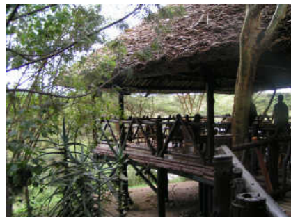
MARA SIMBA LODGE

Enjoy an early morning balloon flight over the Mara, followed by a bubbly bush breakfast (optional extra £275), or an early morning game drive followed by breakfast at the lodge. A second game drive will take place in the late afternoon. Overnight: Mara Simba Lodge (breakfast, lunch and dinner included).