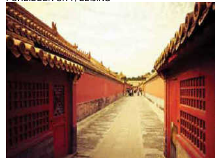
FORBIDDEN CITY, BEIJING

Experience a rickshaw ride through the Traditional Hutong areas and tour the exquisite Summer Palace. Our evening meal includes the local delicacy, Peking Duck.