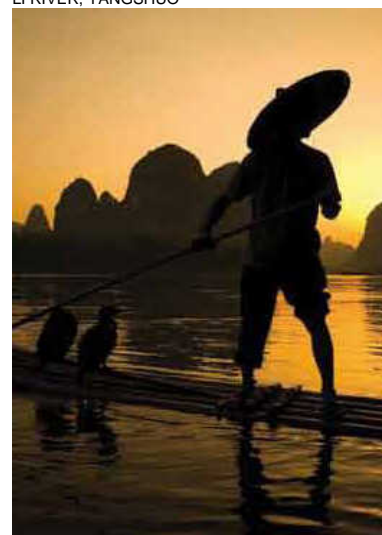
LI RIVER, YANGSHUO

Cruise the stunning Li River and enjoy the breathtaking landscape of beautiful limestone hills, tranquil fishing scenes and picturesque villages. We continue downstream to the town of Yangshuo set in the lush green rice paddies of Southern China. The next day, explore the colourful local markets, walk along the cobblestone streets and soak in the atmosphere of this charming town before returning to Guilin. Here we stroll through the picturesque Seven Star Park to see the colourful stalagmites and stalactites of Seven Star Cave, which is the largest in the area. We also visit the 'Giant Panda Hotel', which is home to one of these adorable animals. We also see the cormorant fishermen.