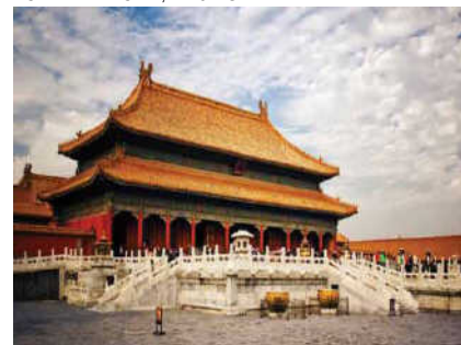
FORBIDDEN CITY, BEIJING

For more details or to book call 020 8989 0970 or visit us at www.escapeworldwide.co.uk