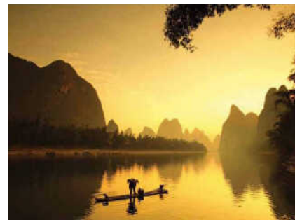
LI RIVER CRUISE

Cruise the stunning Li River and enjoy the breathtaking landscape of beautiful limestone hills, tranquil fishing scenes and picturesque villages. We continue downstream to the town of Yangshuo set in the lush green rice paddies of Southern China. The next day, explore the colourful local markets, walk along the cobblestone streets and soak in the atmosphere of this charming town before returning to Guilin to visit the stunning stalagmites and stalactites of the colourful Reed Flute Caves. We also see the cormorant fishermen.