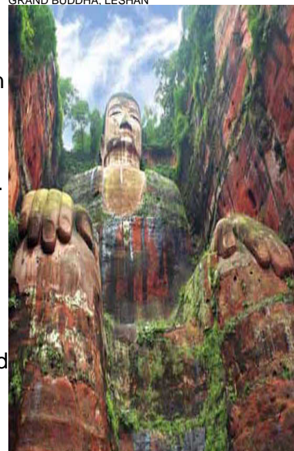
GRAND BUDDHA, LESHAN

Travel to Leshan to visit the Grand Buddha, the world's largest stone-carved Buddhist statue. We take a short boat trip to view the statue from the river. The carving of the Buddha into the side of Lingyun Mountain began in 713AD and was completed in 803AD. After lunch, continue to Mt Emei (Emeishan) – a UNESCO world heritage site, one of China's most picturesque mountains and the highest of the four sacred Buddhist mountains in China. We stay in the area for two nights.