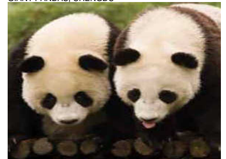
GIANT PANDAS, CHENGDU

Return to Chengdu, stay overnight and enjoy a delicious Sichuan meal.